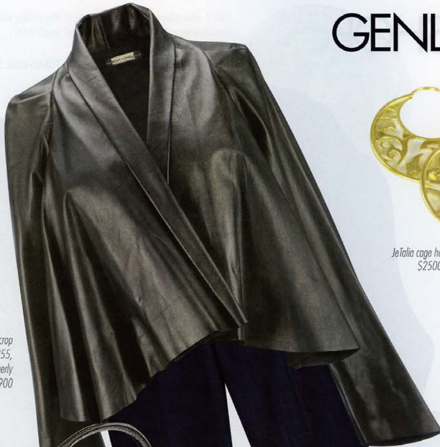
Rozae Nichols crop leather jacket, $855, Neiman Marcus, Beverly Hills, 310-550-5900