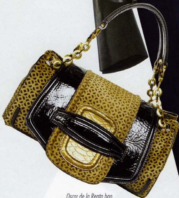
Oscar de la Renta bag, price upon request, oscarde la renta.com