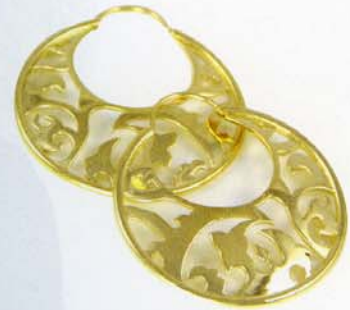
JeTalia cage hoop earrings 18K yellow gold, $2500, Kaviar & Kind, Sunset Blvd, 310-659-8857, jetalia.com